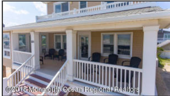
Front Porch 2