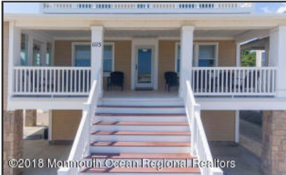
Front Porch 1