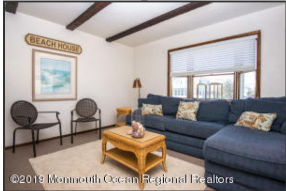
Second Floor Unit Living Area