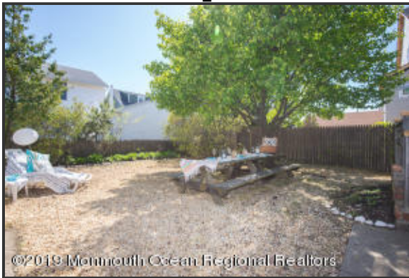
Large private backyard