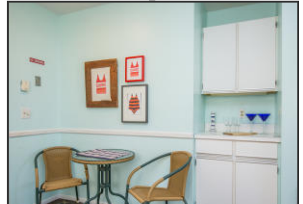
Large eat in Kitchen with more dining on sun porch - First Floor unit