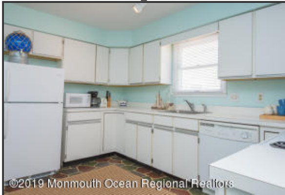
Large eat in Kitchen with more dining on sun porch