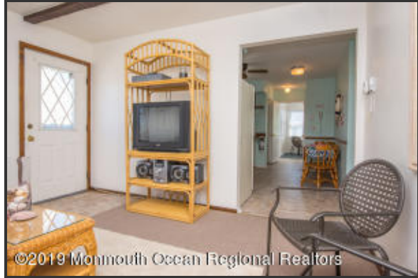
Second Floor Unit Living Area