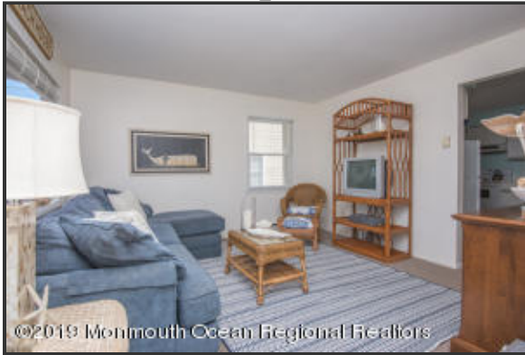
1st Floor Unit Living room