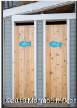
Shower areas - Unit 1 and unit 2