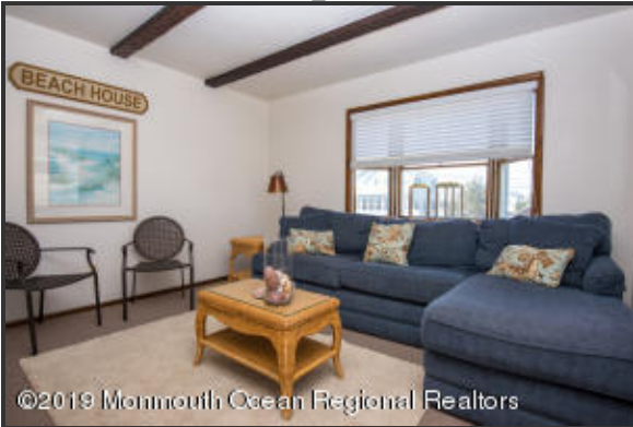
Second Floor Unit Living Area