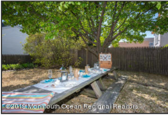
Backyard BBQ's, play, fun and and sun.