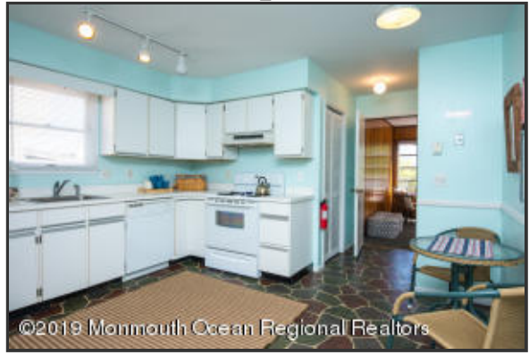
Large eat in Kitchen with more dining on sun porch - 1st Floor Unit