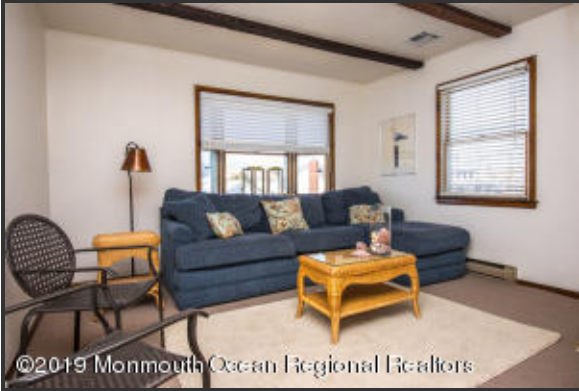
Second Floor Unit Living Area