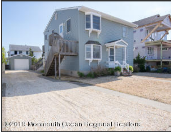
2 Family Shore House one block from Ocean and Bay!