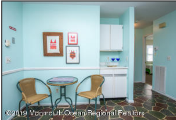
Large eat in Kitchen with more dining on sun porch - 1st Floor Unit