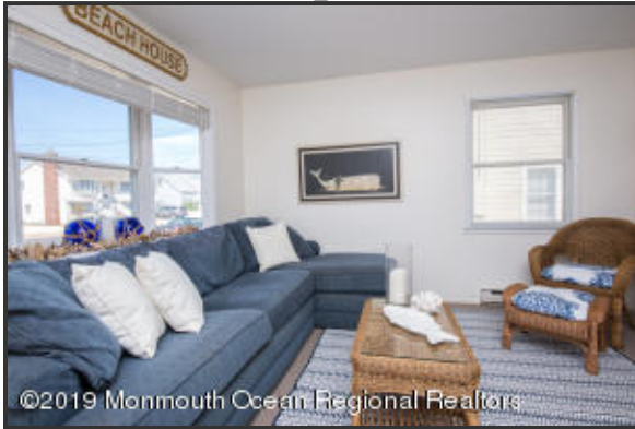
1st Floor Unit Living room