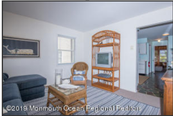
1st Floor Unit Living room