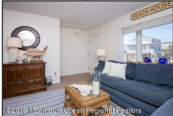
1st Floor Unit Living room