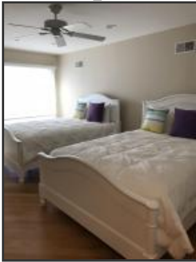
Bedroom 3. Spacious bedroom. large enough for 2 queens. Overlooking pool area