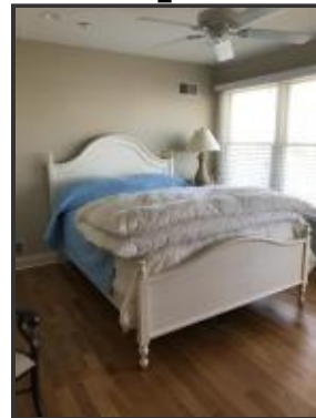
Bedroom 2 Ocean front view with doorway to front balcony.