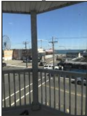
Balcony overlooking the ocean front