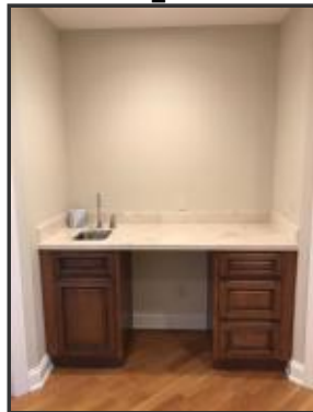
Wet bar vanity on master bedroom level