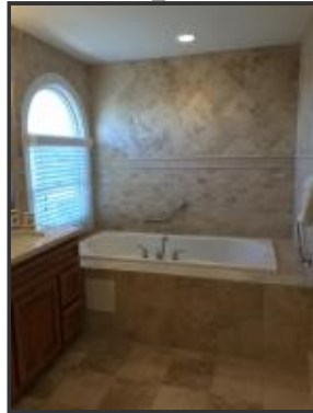
Master bath with whirlpool.