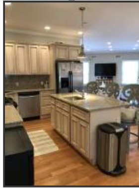
Kitchen with High end Frigidaire appliance package