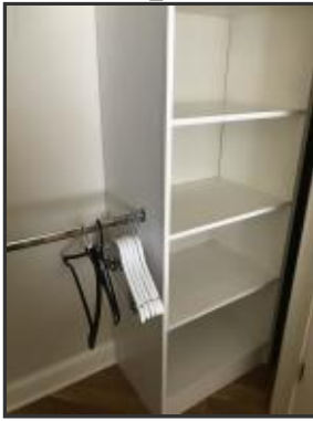
Built-ins in every closet