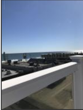
Lovely views from roof top deck