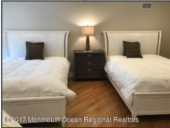
Bedroom 4. Another spacious bedroom. Large enough for two queen or king size beds