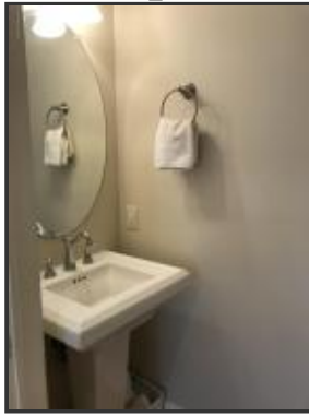
Half bath off dining area