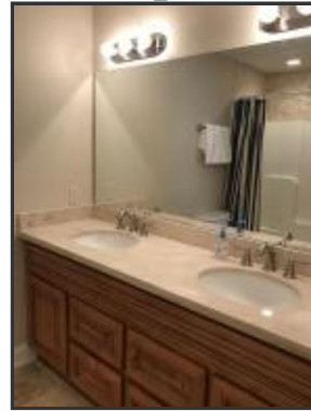
Bath with double sinks and tub and shower