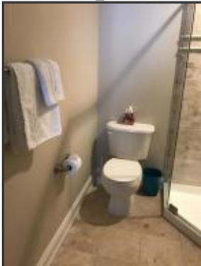
Another bath with fully enclosed glass shower