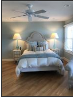
Master bedroom with french door