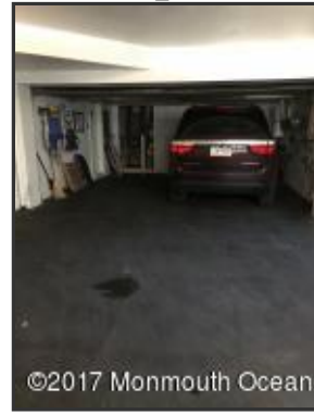
Oversized 2+ car garage with rubber flooring and lots of storage. Direct entry to foyer