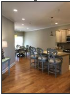
Breakfast bar looking into the dining room