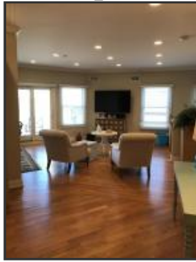
Very spacious living room with hardwood floors