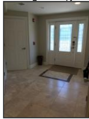
Leaded glass front door into spacious foyer