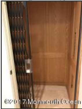
Elevator which begins on foyer level and goes to every floor and roof top.