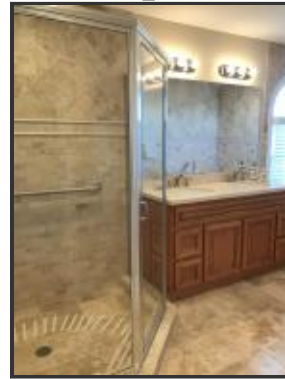
Master bath with oversized glass enclosed shower