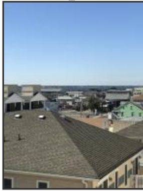
Lovely views from roof top deck