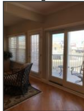
Living room sliding door to terrace/balcony