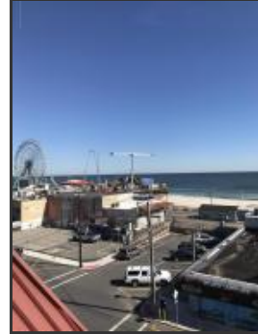
Lovely views from roof top deck