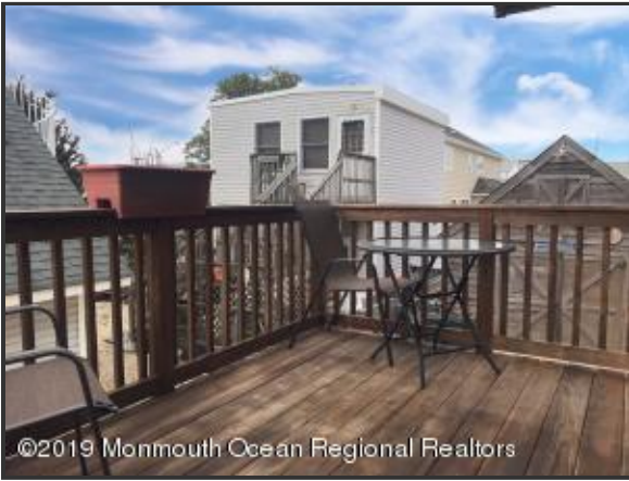
1st Floor Deck