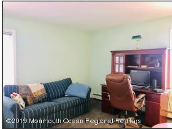
1st Floor Bedroom 2