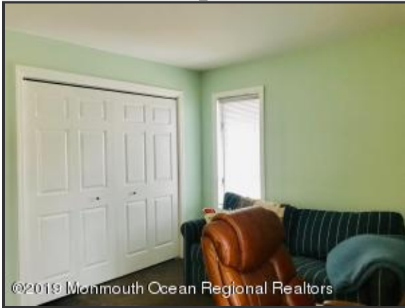
1st Floor Bedroom 2