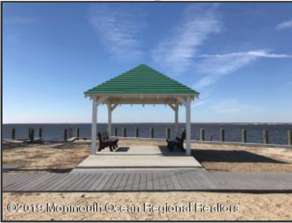
13th Avenue Fishing & Crabbing Pier