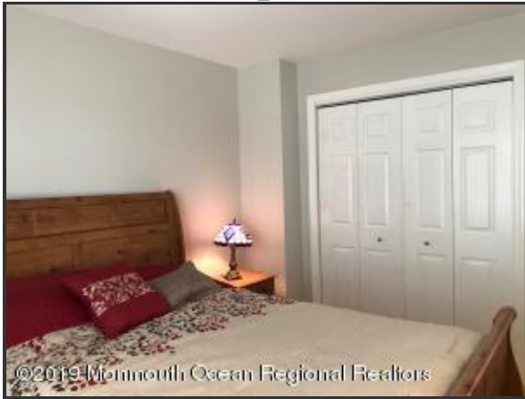
First Floor Bedroom 1