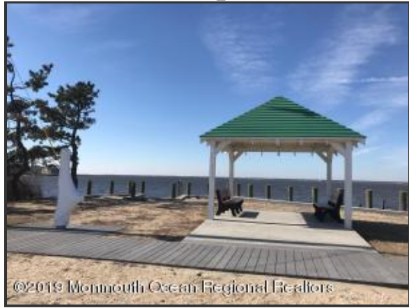
13th Avenue Fishing & Crabbing Pier