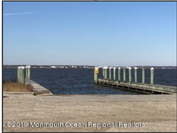
13th Avenue Boat Ramp