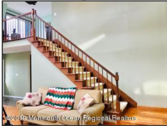
Stairway to 2nd Floor