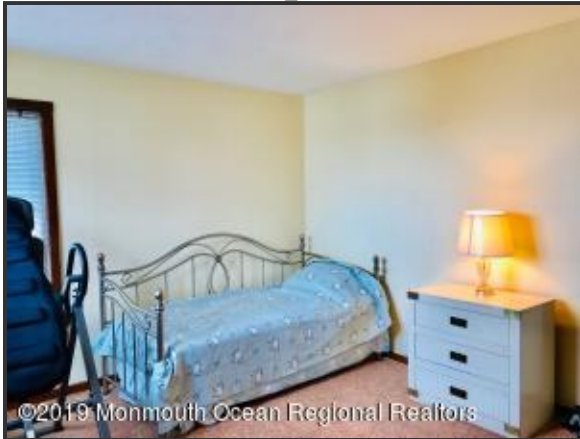
2nd Floor Bedroom 3