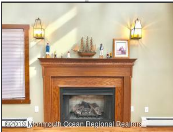
Great Room Gas Fireplace