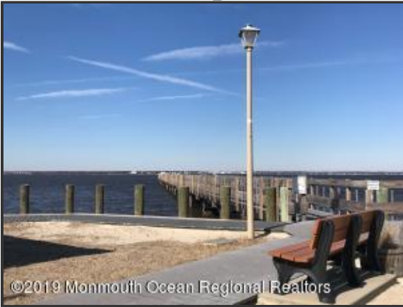
13th Avenue Fishing & Crabbing Pier