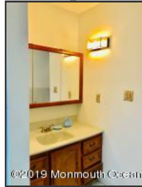
2nd Floor Bath