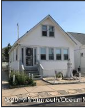
23 N Street, Seaside Park