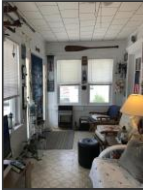
Fully enclosed outside room