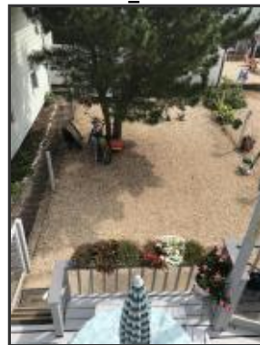
View from top deck