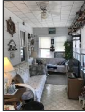
Fully enclosed outside room